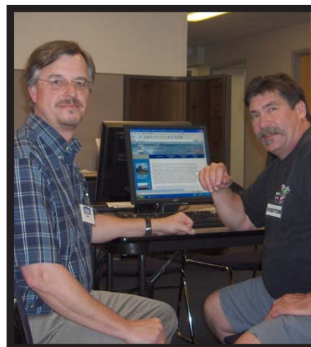
The Santa Cruz Shoreline Career Center helps people with job search and into employment.