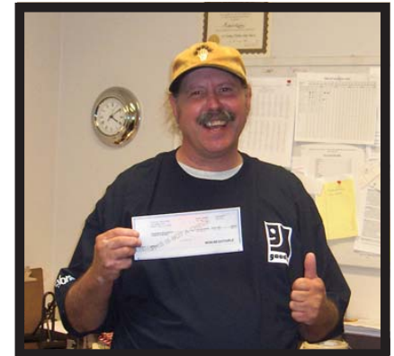
A complete Outcomes Report for Shoreline Workforce Development 2008 is available on their website, www.shorelineworks.org