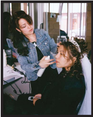
Shoreline Workforce Development Services offers a variety of services and training programs including a school of Cosmetology.