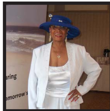
The Goodwill Auxiliary raises thousand of dollars a year through events like their Annual Fashion Show.