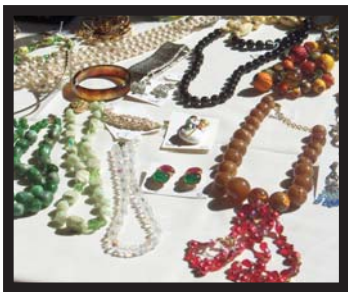
Goodwill offers jewelry in stores and at special sales at a fraction of the cost.

The Auxiliary earns revenue through special sales and events such as their Annual Silver Sale in September and a Fashion Show in August. They hold two large jewelry sales each year as well as operate a boutique called the Collectors Corner, located in the Santa Cruz Goodwill Store. The Goodwill Auxiliary always welcomes new members of any gender or age. For more information on how to join, visit sgoodwill.org