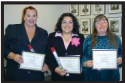
Programs offered by Shoreline Workforce Development Services are fully accredited.

Nearly 85% of our clients were on welfare, unemployed or underemployed and needed assistance or training to improve their earning power. Physical disabilities accounted for 10%, some of them due to work-related injuries. Clients with psychiatric or mental disabilities made up 4% of those we served. Less than 1% had other types of barriers.