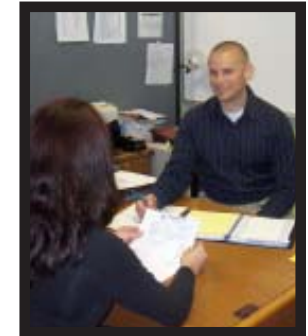
Counselors at the Salinas Career Center offer skills assessments and facilitate On-the-Job Training placements.