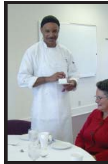
A complete Outcomes Report for Shoreline Workforce Development 2006 is available on their website, www.shorelineworks.org