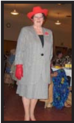
The Goodwill Auxiliary raises thousand of dollars a year through events like their Annual Fashion Show.

One of the ways the Auxiliary earns revenue is through hosting events such as their Annual Goodwill Fashion Show and Luncheon. This year's theme was "Through The Looking Glass" and 170 people attended the event. All the food was prepared by Shoreline's Culinary Arts students and the clothing was selected from the Goodwill Stores.