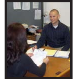
Counselors at the Salinas Career Center offer skills assessments and facilitate On-the-Job Training placements.