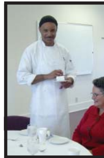
A complete Outcomes Report for Shoreline Workforce Development 2006 is available on their website, www.shorelineworks.org